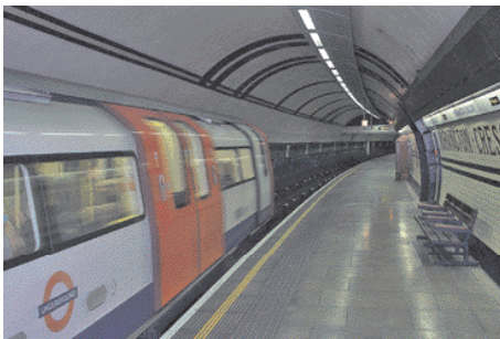
Figure 1: Tube train

[ http://en.wikipedia.org/wiki/File:TubeStationWithTrain.jpg ]