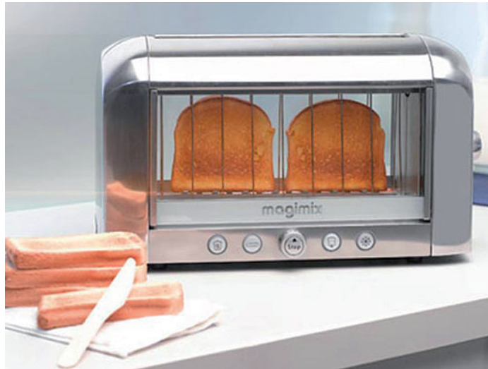
Figure 12: Le Toaster Vision by Magimix.