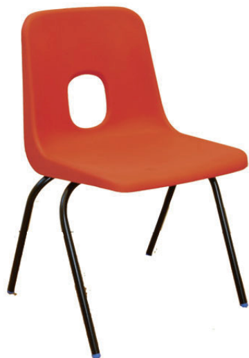
Figure 7: Robin Day’s stackable polypropene chair