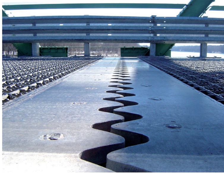
Figure 6: Expansion joint on a bridge